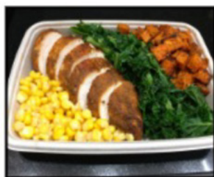
Chicken & Kale