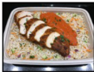
Chicken & Rice